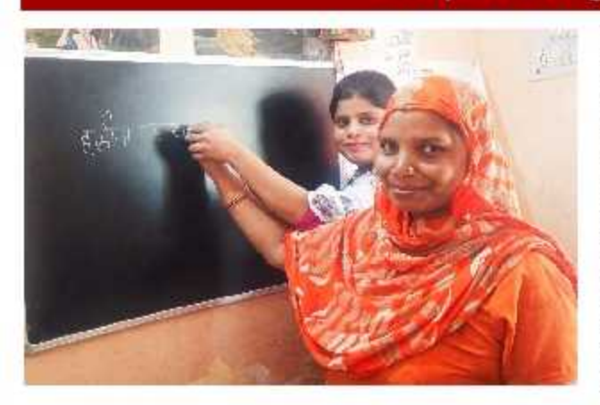
"Investing in knowledge pays the best dividends."